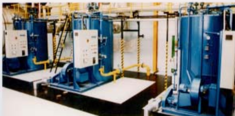
3 x Model 2500 RR VPX Babcock Wanson Steam Generators