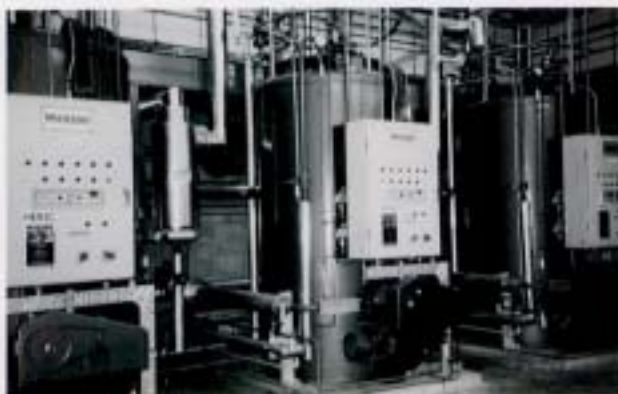
3 x Model 3500 RR VPX Steam Generators