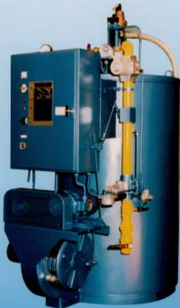
Model 1200 RR VPX Steam Generator